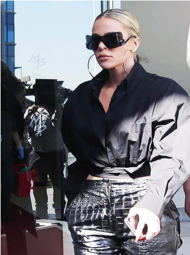
Kourtney Kardashian spotted

The Slick-Back Ponytail has been a hairstyle we've been seeing everywhere and everyone's doing it. This effortless look has been seen done by influencers, celebrities, models on the runway and pretty much- everyone. How does such a simple hairstyle look so glamorous? Well here's the thing- it's convenient. Second day hair? Slick-back Ponytail. Running errands? Slick-back Ponytail. Going to the club but don't have time to get ready? Slick-back Ponytail. Although it may seem hard to pull off, it really is the most simple yet classy look of the season.