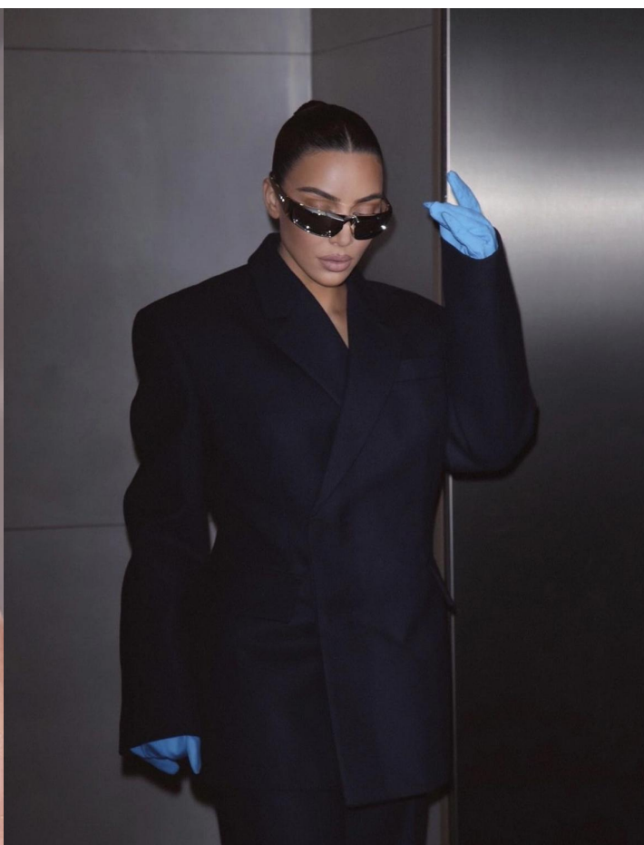
Kim Kardashian